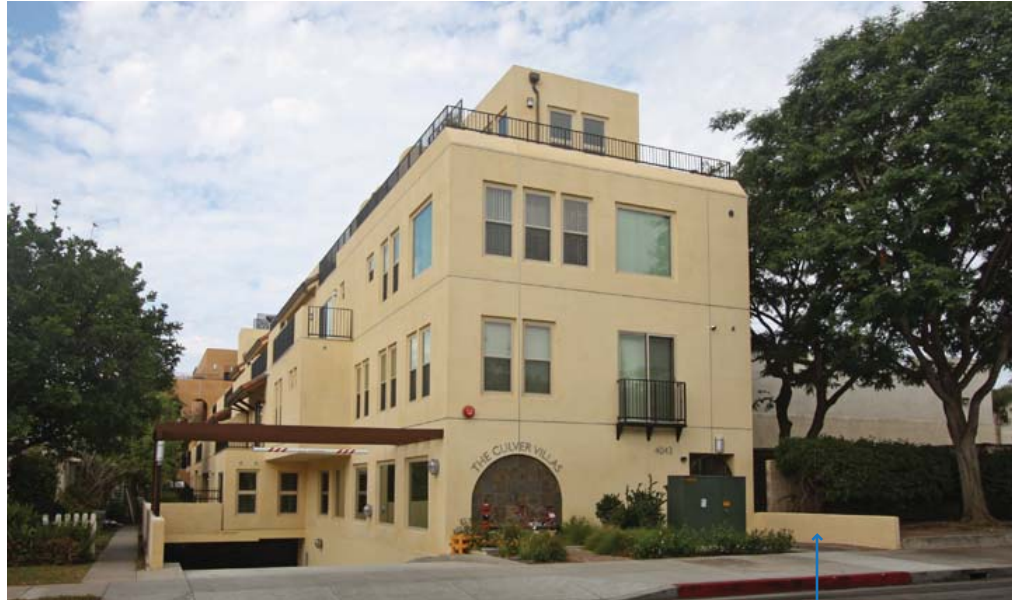
Suite Entry off of Irving Place

Parking: Three reserved spaces at $120/space/month